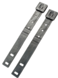
MOLLY CLIP ACCESSORY