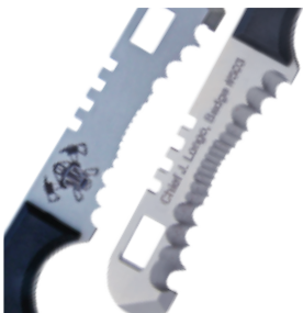
CUSTOM ENGRAVING OR PERSONALIZATION