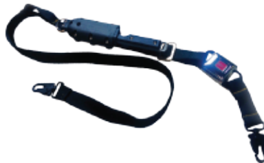
FLASHLIGHT STRAP OR FIRE AND FLASHLIGHT STRAP BUNDLE