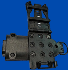
TEK-LOK Attachment Option