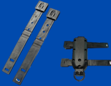
MOLLY CLIP Attachment Option